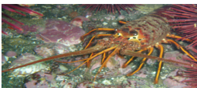
Claire Fackler; Channel Islands National Marine Sanctuary