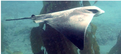
Robert Schwemmer; Channel Islands Marine Sanctuary

Cut out these pictures of animals mentioned in The Neptune Project . Classify the animals by matching the animals to the physical traits listed on in the animal classification table.